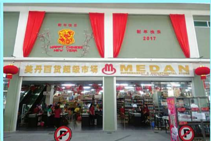
Medan Supermarket & Departmental Store