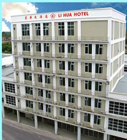
6-Storey Li Hua Hotel (113 rooms)