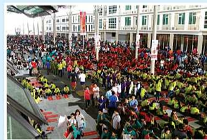
The 'Largest Chinese Calligraphy Event' held at UniCity with a whopping 6,140 participants.

Typical Intermediate Unit: 20 ft x 60 ft Typical Corner Unit: 25 ft x 60 ft