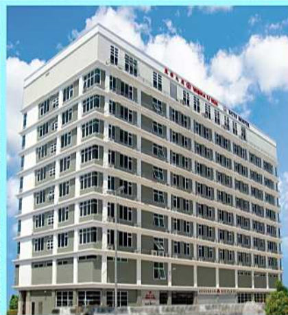
10-Storey Wisma Li Hua (203 rooms for UCTS Hostel)