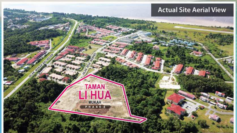
Actual Site Aerial View

Prime Location Close to School and Mukah Town Centre